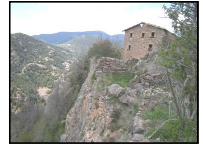
View of the mansion of Bonner

The village was inhabited until the sixties of the last century, and between its ruins there is one of the most important mansions of these valleys, sign of the former wealth of the place.